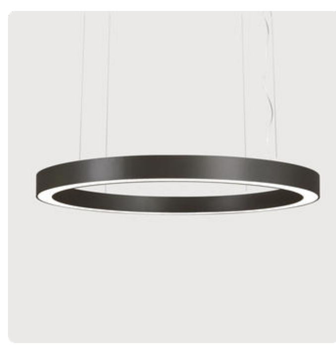
Illustrations may only be similar and serve as an orientation.