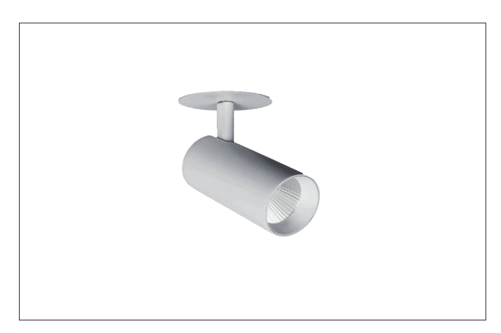
Light. For Generations.