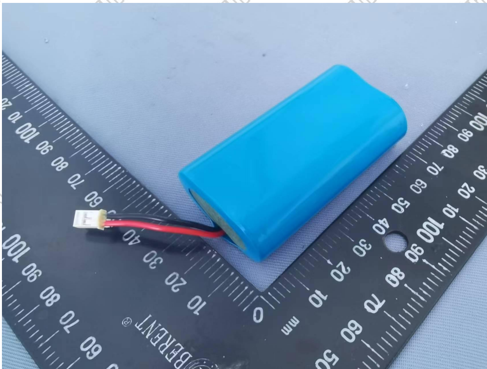
Figure 2 Overall view II of battery (外观图II)