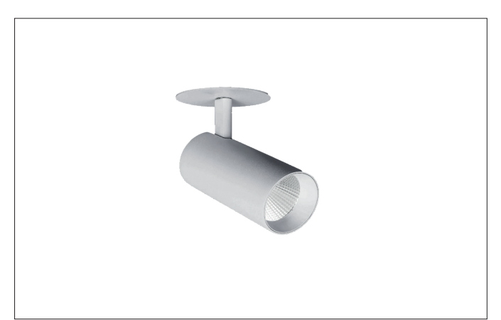
Light. For Generations.