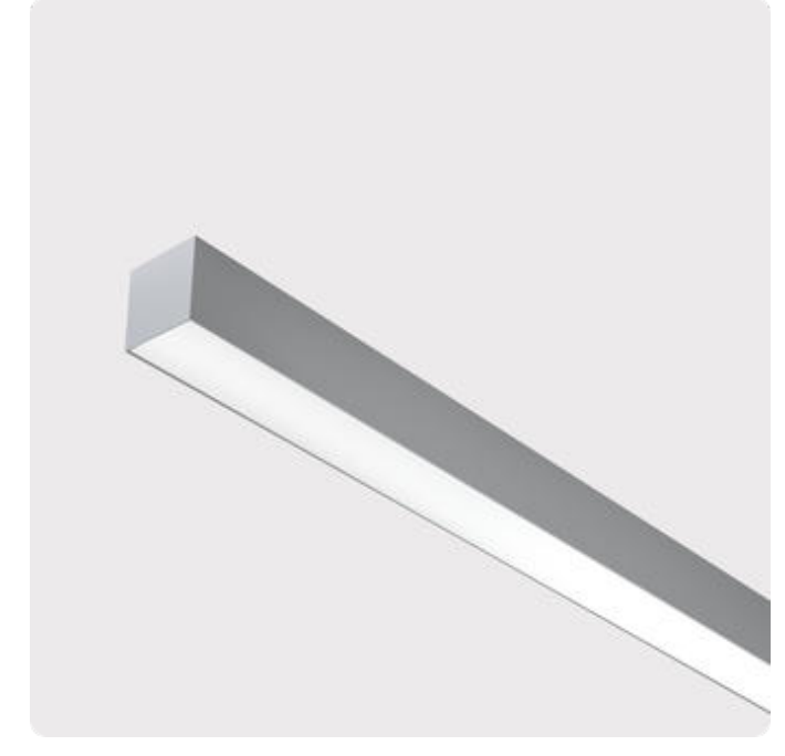
Illustrations may only be similar and serve as an orientation.

Surface mounted light-line - Direct light distribution