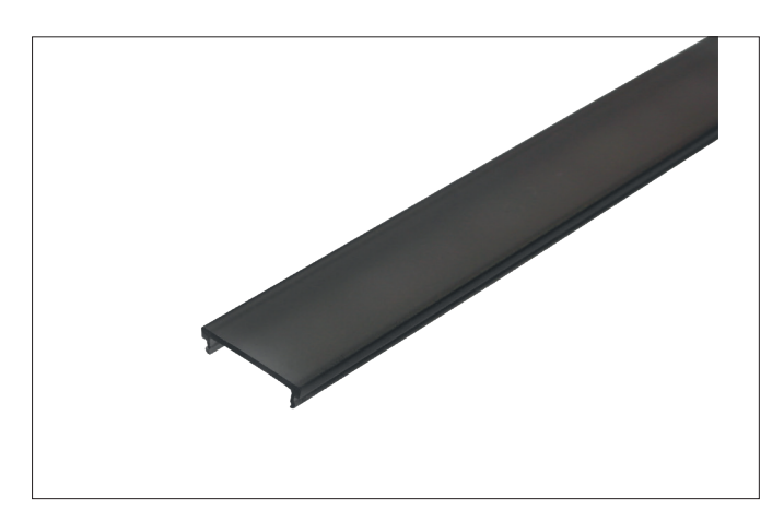
Light. For Generations.