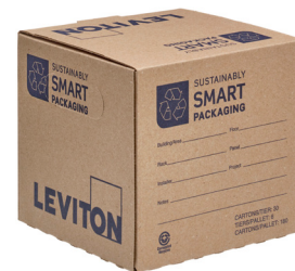
GREENPACK™ Bulk Pack Packaging