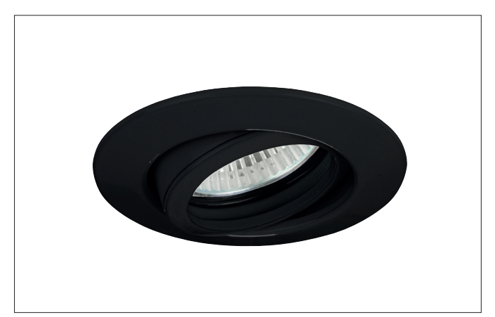
Light. For Generations.