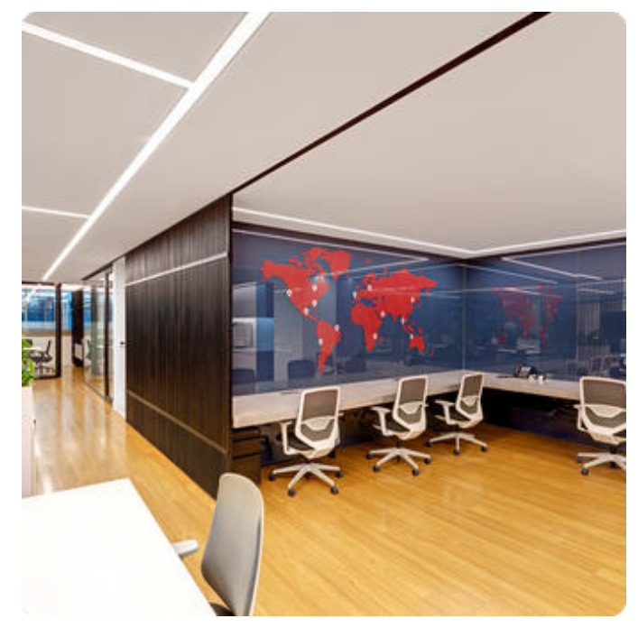
Illustrations may only be similar and serve as an orientation.

Matric-F3. LED. Recessed mounted light line with surrounding frame for installation in sawn wall and ceiling with cut-out openings. Mounting brackets included. Luminaire body made of high-quality aluminum profile. Surface finish Silver Anodised. Direct only light distribution. Colour temperature: 4000K (Cool White). Colour Rendering Index (CRI): >80. Lens Louvre: precision lenses with louvre. High glare limitation, compatible for office applications. Reflector: Satin Silver. Dimmable DALI. LxWxH