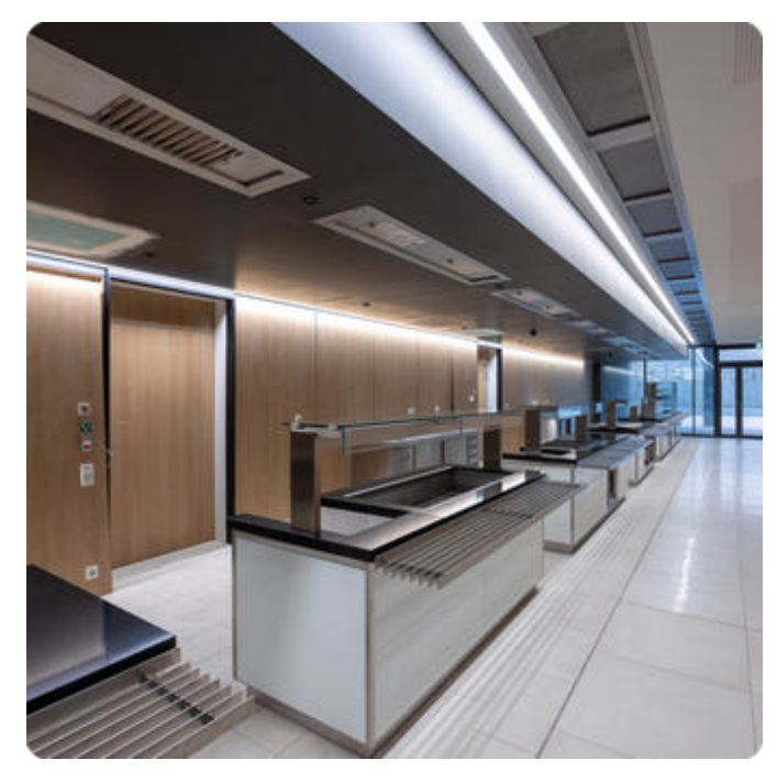
Illustrations may only be similar and serve as an orientation.

Matric-F5. LED. Recessed mounted light line with surrounding frame for installation in sawn wall and ceiling with cut-out openings. Mounting brackets included. Luminaire body made of high-quality aluminum profile. Surface finish Silver Anodised. Direct only light distribution. Colour temperature: 4000K (Cool White). Colour Rendering Index (CRI): >80. Microprismatic screen for uniform illumination and reduced luminance in office areas. UGR<=19. Switchable. LxWxH (rectangular). L=905mm. W=