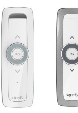
Situo 1 Variation io II

The programming button located at the back of the transmitter allows to memorize the address of the transmitter in one or several receivers. It is the pairing process.