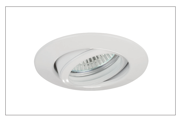
Light. For Generations.