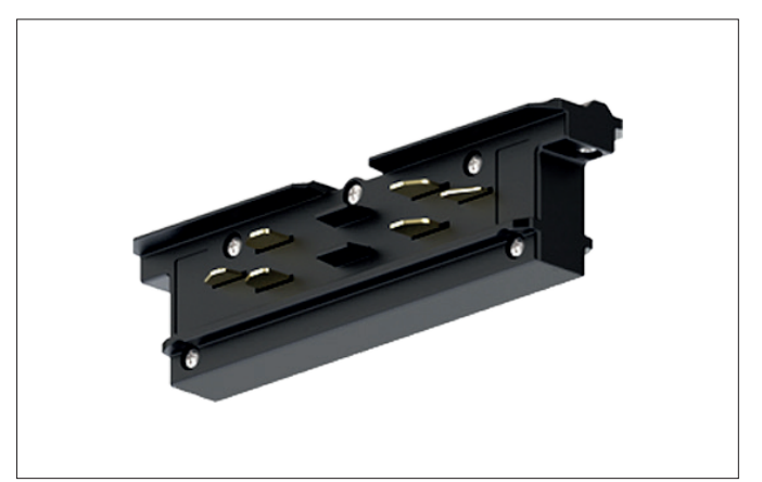
Light. For Generations.