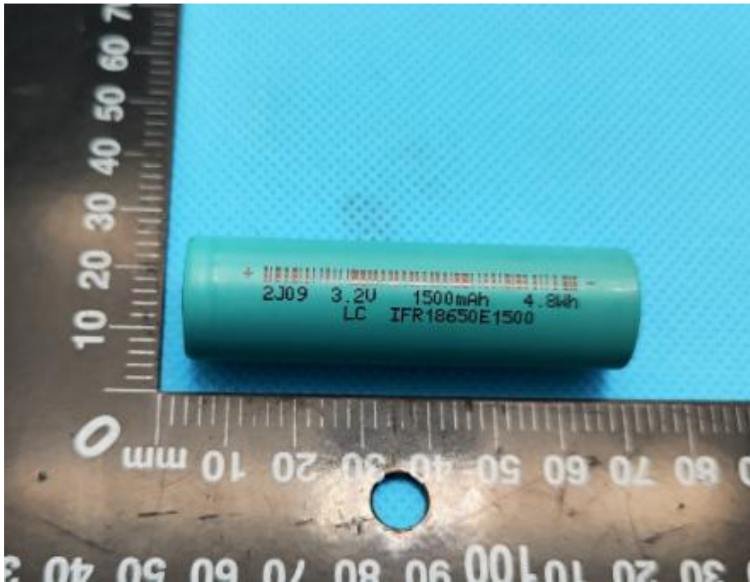
Cell /电芯 (IFR18650E1500 3.2V 1500mAh 4.8Wh)