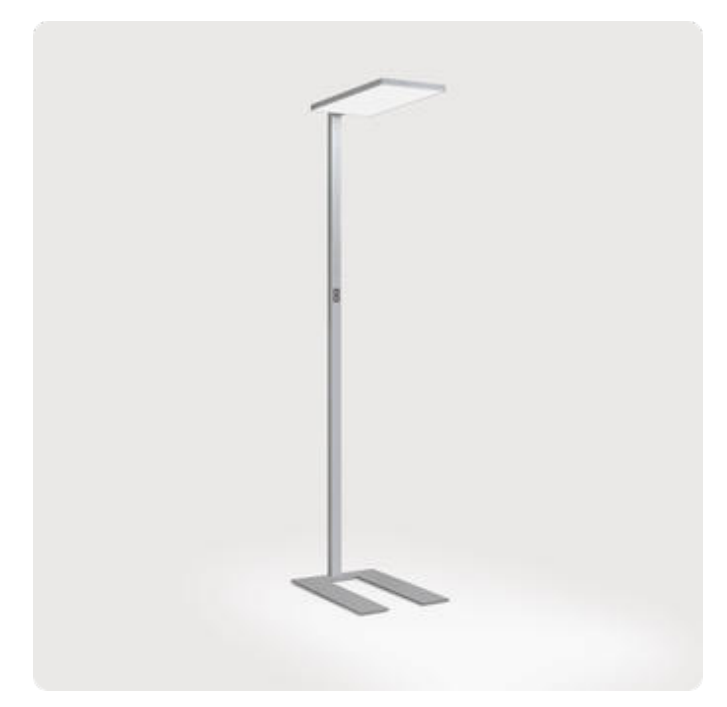
Illustrations may only be similar and serve as an orientation.

Free standing luminaire - Direct/indirect light distribution