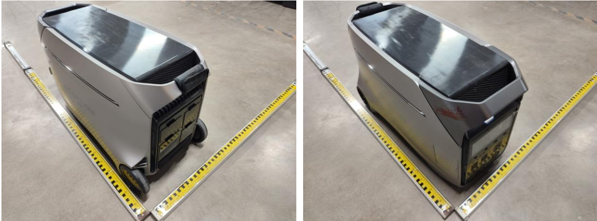
Battery/电池（EFD521 51,2V 80Ah 4096Wh）