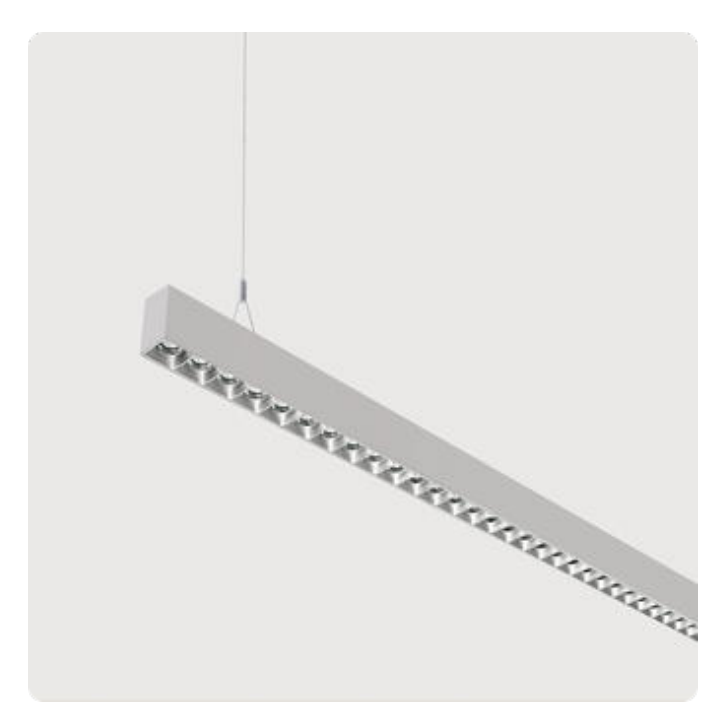
Illustrations may only be similar and serve as an orientation.

Matric-R3. LED. Pendant light-line. Luminaire body made of high-quality aluminum profile. Surface finish Silver Anodised. Direct/indirect light distribution. Colour temperature: 3000K (Warm White). Colour Rendering Index (CRI): >80. Lens Louvre: precision lenses with louvre. High glare limitation, compatible for office applications. UGR<=16. Reflector: Satin Silver. Dimmable DALI. LxWxH (rectangular). L=1502mm. W= 55mm. H=85mm. Y-cord suspension with power supply cable and ceiling rose (Set). Pendant length max 1500mm. Power supply: transparent.