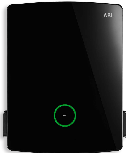
Product number 100000004

The robust design and high-quality workmanship of the Wallbox eM4 Twin protect it from external influences. The wallbox comes pre-installed and ready for connection thanks to the integrated Type A RCCB and DC residual current detection. All ABL wallboxes are made in Germany and comply with the highest safety standards.