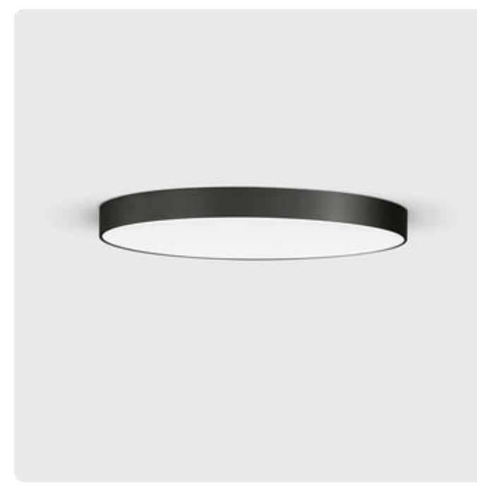
Illustrations may only be similar and serve as an orientation.

Basic-A1. LED. Surface mounted luminaire for wall or ceiling mounting with minimalist edge. Luminaire body made of highquality aluminum profile. Surface finish Jet Black. Direct only light distribution. Colour temperature: 4000K (Cool White). Colour Rendering Index (CRI): >80. Microprismatic screen for uniform illumination and reduced luminance in office areas. Dimmable DALI. DxH (round). D=300mm. H=75mm. Medium-power current. 1730lm. 13W.