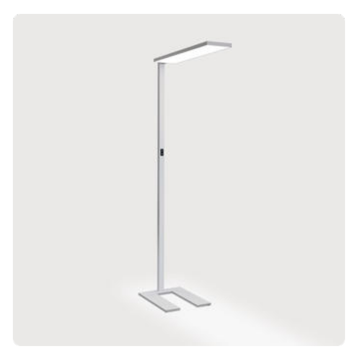
Illustrations may only be similar and serve as an orientation.

Cubic-F1. LED. Free standing luminaire. Luminaire head with 25mm minimalist overall height. Luminaire body made of highquality aluminum profile. Surface finish Silver Anodised. Direct/indirect light distribution. Colour temperature: 3000K (Warm White). Colour Rendering Index (CRI): >80. Microprismatic screen for uniform illumination and reduced luminance in office areas. UGR<=19. Separate stepless dimming of the direct/indirect light chambers. LxWxH (luminaire head, rectangular/Stand). L=