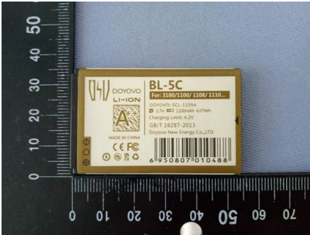
Figure 1 Overall view I of battery (外观图I)