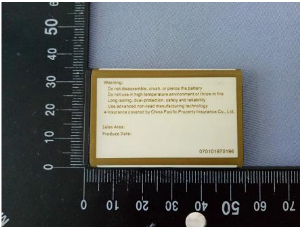
Figure 2 Overall view II of battery (外观图II)